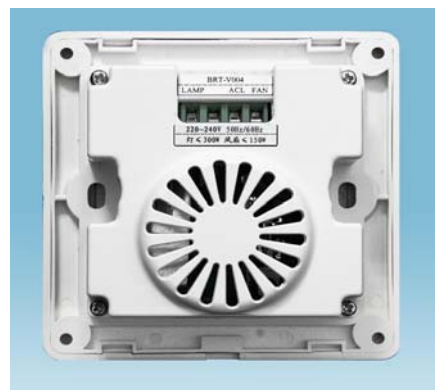
Fig. 2 Back View

As shown in Fig. 1 and Fig. 2, BRT-V004 keypad ventilation fan speed and lighting control and 5 LED indicators on the front, and wiring terminal blocks on the back. Each LED indicates the current delay off time respectively.