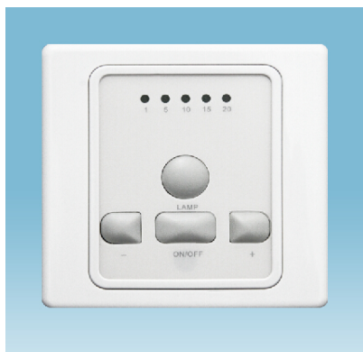
Fig. 1 Front View

Fig. 1 and Fig. 2 show the front view and the back view of BRT-V004 speed control switch respectively.