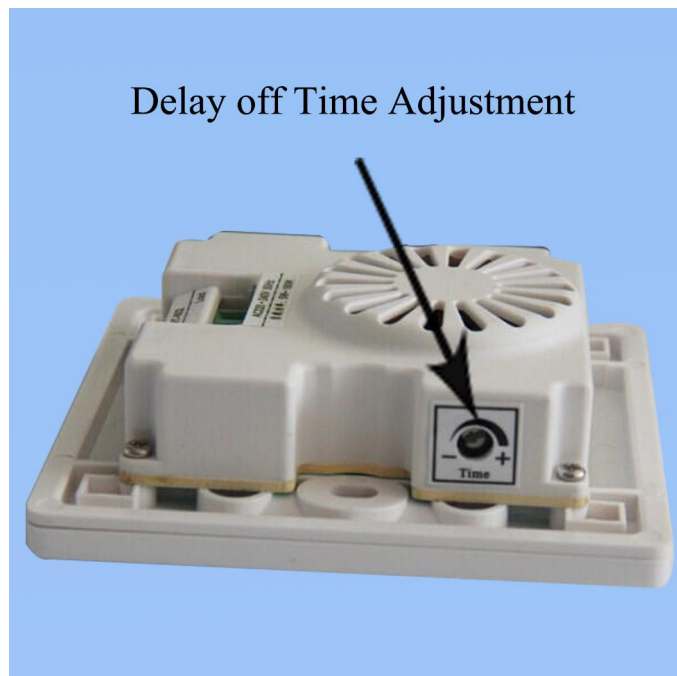
Fig. 5 Set up Delay-off Time

to adjust the delay-off time, as shown in Fig. 5. The delay-off time can be set from 10s to 15 minutes.