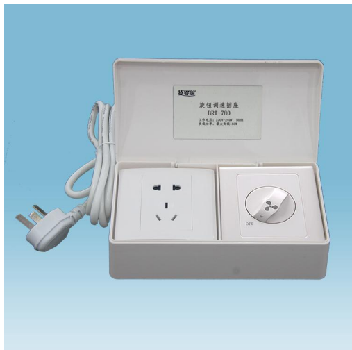
Fig. 1 Front View

Fig. 1 and Fig. 2 show the front view and the back view of the BRT-780 speed control switch respectively. It has a rotary control unit on the right and a standard socket on the left. It comes with a power cord on the back.