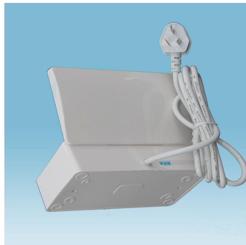
Fig. 2 Back View