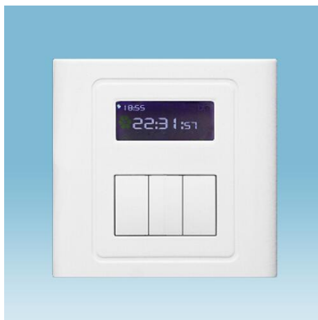
Fig. 1 Front View

Fig. 1 and Fig. 2 show the front view and the back view of the wall mount unit of BRT-607 timer switch respectively.