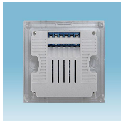
Fig. 2 Back View