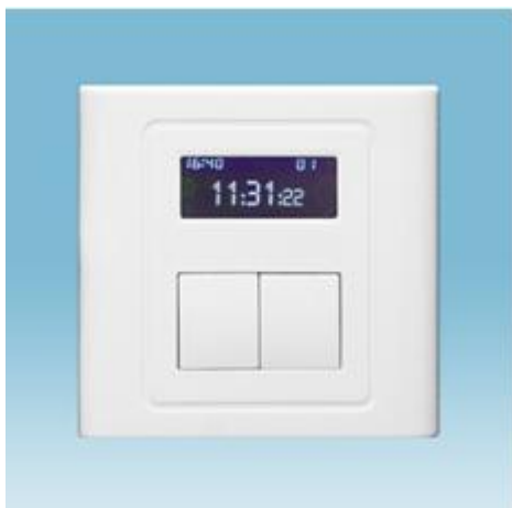
Fig. 1 Front View

Fig. 1 and Fig. 2 show the front view and the back view of the wall mount unit of BRT-603 timer switch respectively.