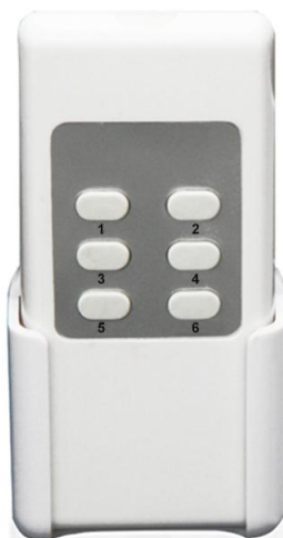
Fig.4 Remote Control Set

As shown in Fig. 3, the front plate can be flipped down from the top edge. A 9 keypad panel hidden behind the front plate is used for setting up the timer. Please refer to “BRT-605 Timer Switch Setup” for details.