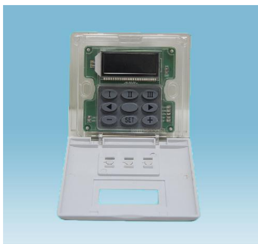
Fig.3 Hidden 9 Keypad Panel

If there is delay off time being set, the load will be turned off only after the preset delay off time runs out. Meanwhile, the display will show a “bell” sign. Press the On/Off button will cancel the delay off operation and turn off the load immediately.