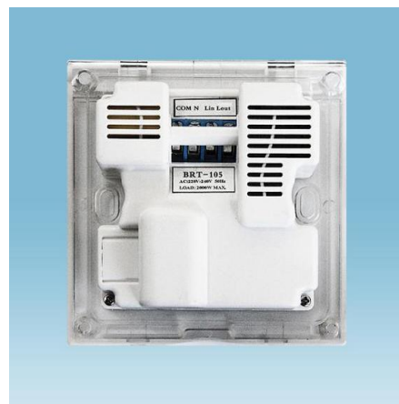
Fig. 2 Back View