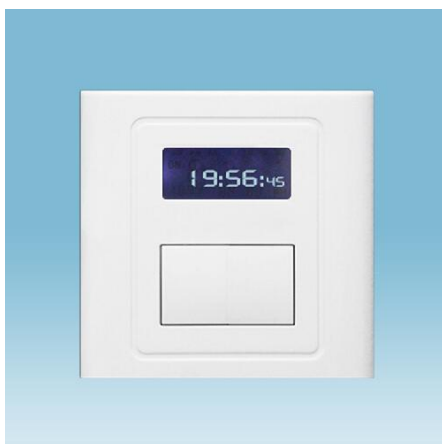
Fig. 1 Front View

Fig. 1 and Fig. 2 show the front view and the back view of the wall mount unit of BRT-605 timer switch respectively.