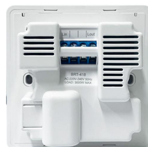
Fig. 2 Back View