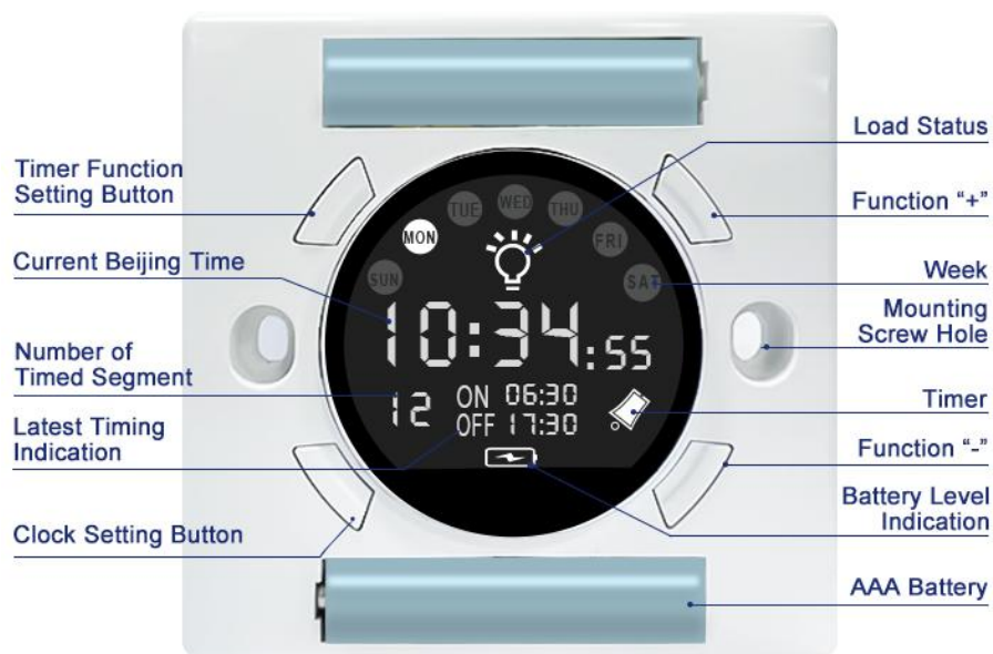
Fig. 6. The buttons and icons for setting up timer

2.4 After the setting is completed, press Time button to save and exit.