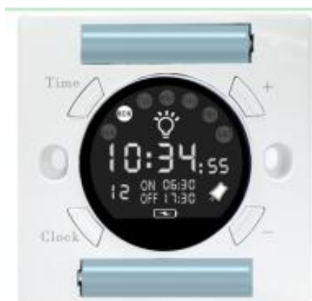
Fig. 5 The inside view of the timer

When the screen is on, press the round screen in the middle, the load turns on, the "💡" icon on the screen lit up, then press the round screen again, the load turns off, the "💡" icon on the screen is off.