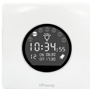
Fig. 1 Front View

Opening the cover, there is a Time button, Clock button, "+" "-" button around the LCD .