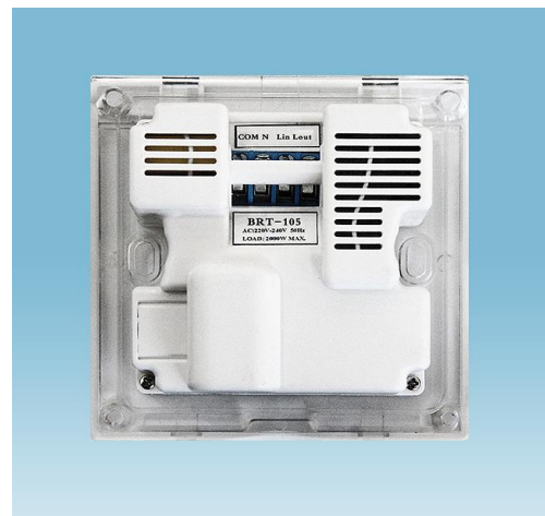
Fig. 2 Back View